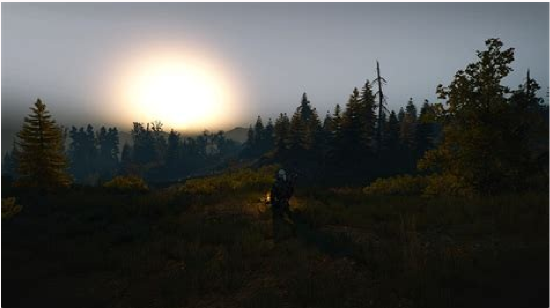
How to meditate witcher 2 xbox. How to meditate in witcher 2 xbox 360.